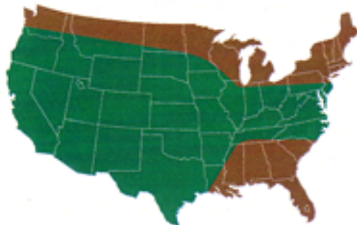
Area of Adaptation for Bowie Buffalograss

Bowie has a wide range of adaptation extending across the entire country as well as Africa, Asia, Europe and South America. Prior to its release in 2001, Bowie buffalograss was ranked number one for turfgrass quality among seeded varieties at 28 locations evaluated in the 1991-1995 National Turfgrass Evaluation Program (seeded) Buffalograss Cultivar Test. Bowie has shown genetic stability by performing well consistently across years and locations. Bowie is performing well in the current NTEP Buffalograss Trial, exhibiting excellent turf quality (table 1) and Summer Density (table 2).